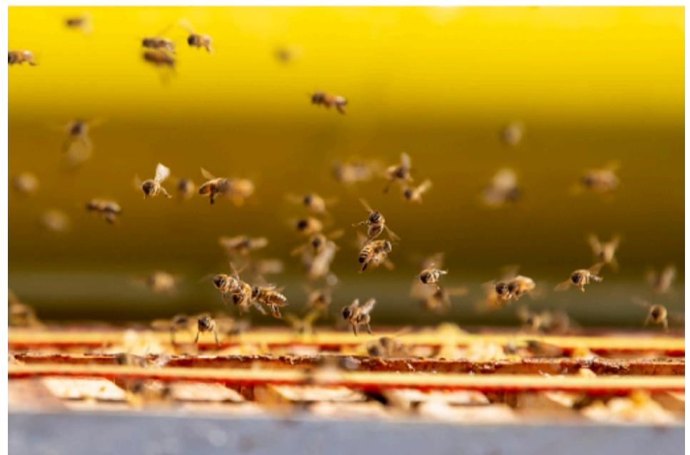
Bees fly around a brood frame

The NBDC-TAC provides critical diagnostic services to beekeepers, researchers, Provincial and Federal agencies and Industry as its contribution towards a healthy, sustainable and profitable apiculture industry in Canada. We employ microbiology, microscopy and molecular techniques in order to identify pests, pathogens and parasites affecting honeybees.